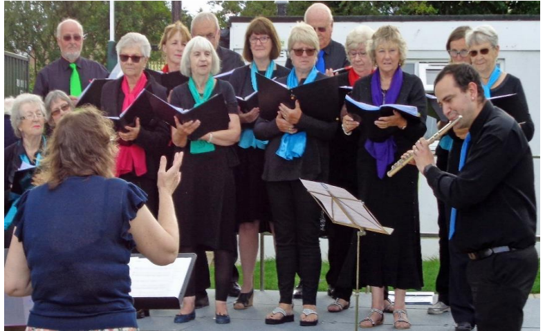
Above – Aylsham Singers performing.

The choir's next concert is Saturday 16th May 2020. Local singers, able to rehearse on Wednesday evenings, can find out more by visiting www.aylshamsingers.co.uk and / or phoning 01263-731170.